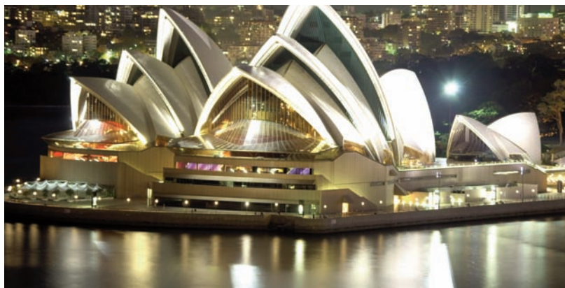
Sydney Opera House in Sydney, Australia

110 million families throughout Asia earning over US$10,000 per year. That number is projected to exceed 200 million by 2012. The rise in income has been shown to correlate with the percent of savings against GDP. Economies such as those of Hong Kong, Singapore, Taiwan and South Korea have had a robust investment industry for decades. The emerging market economies of Asia have a much younger investment industry, with the average investment fund being 15-20 years old. As the region develops further, we expect that the fund industry will continue to grow, increasing cross-border investments and expanding the need for asset servicing overall and tax reclamation in particular. GlobeTax's Sydney office will enable the firm to intensify its coverage in this crucial region, while increasing the level of service and accessibility available to our clients.